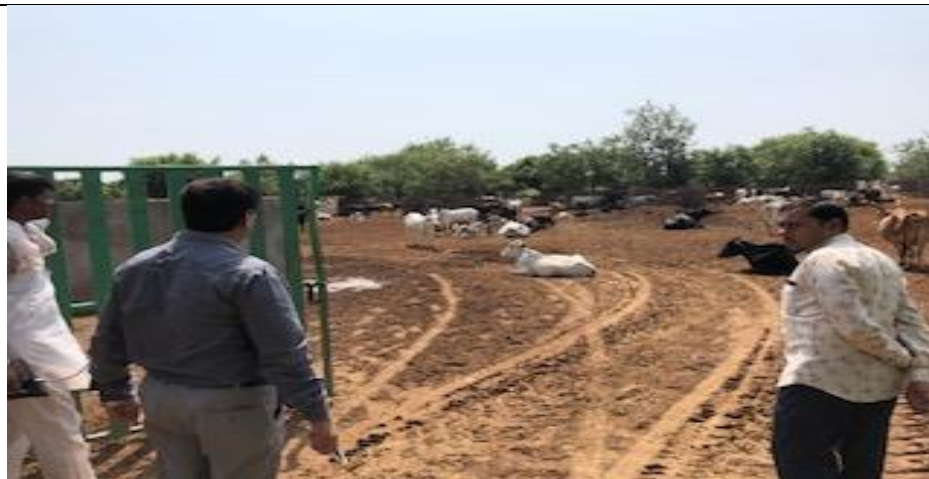
NRCE scientists visit to Goshala, Dhobi village for giving advisory on management aspect