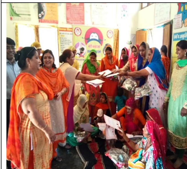
Distributing certificates to mothers of newly born female child