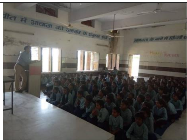
NRCE scientists delivered lecture on Swachha Bharat Abhiyaan and maintenance of personal hygiene and prevention of disease transmission at Govt High School, Kajla, Hisar.