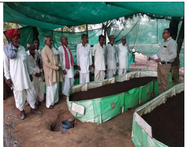
Training on Vermicompost, Bikaner