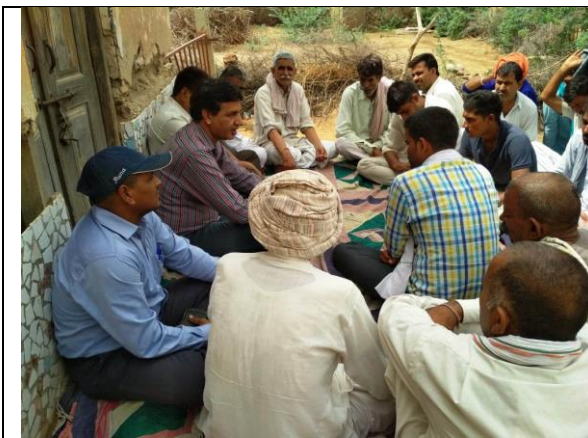
MGMG Programme :NRCE, EPC, Bikaner