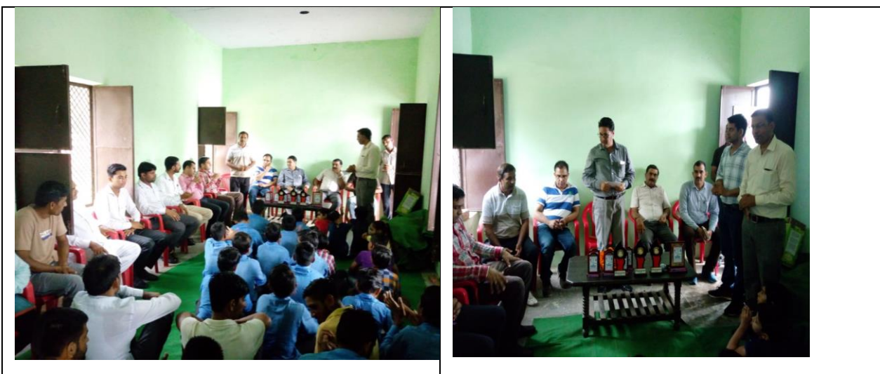
Scientists interacting with school student to create awareness among children on environmental protection and climate change