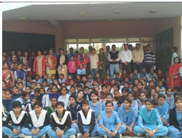
Visit of school students at NRCE