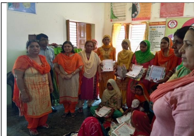
Distributing certificates to mothers of newly born female child.