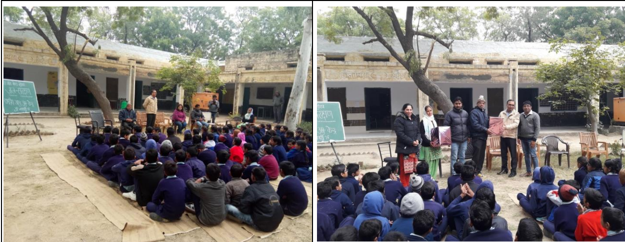
The school students participated to know about water conservation at village Kajla