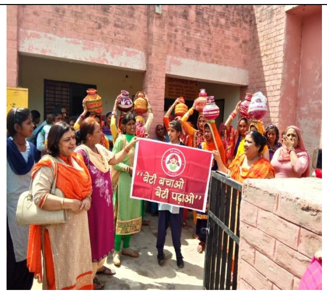
Traditional Celebration of Beti Janam Utsav.