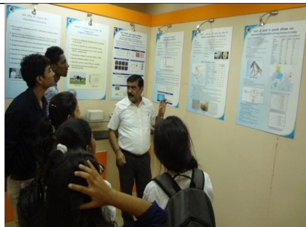
Agriculture students at ATIC, ICAR-NRCE