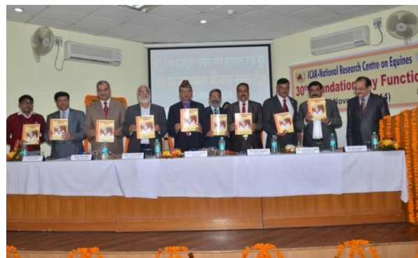
Release of technical bulletin on “Exotic Equine Diseases”