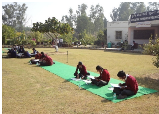
Students during drawing competition