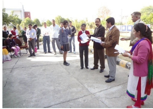
Distribution of certificates to participants