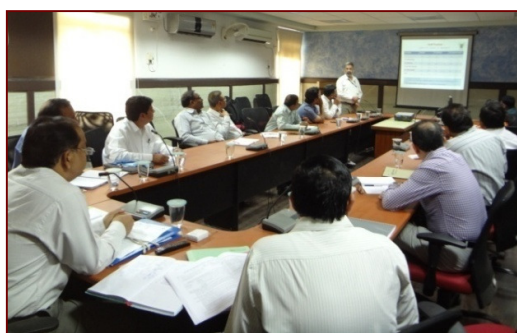
IRC meeting in progress