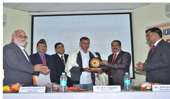
Felicitations of progressive equine owners