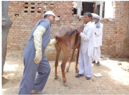
Pregnancy diagnosis at farmers door at Gurana

Equine owners interacted with NRCE scientists on various aspects of equine husbandry and management practices. During the interaction meeting, the equine owners were also made aware about the equine welfare, importance of rest during work periods, proper and timely shoeing and grooming of animals and adoption of improved equine husbandry and management practices.