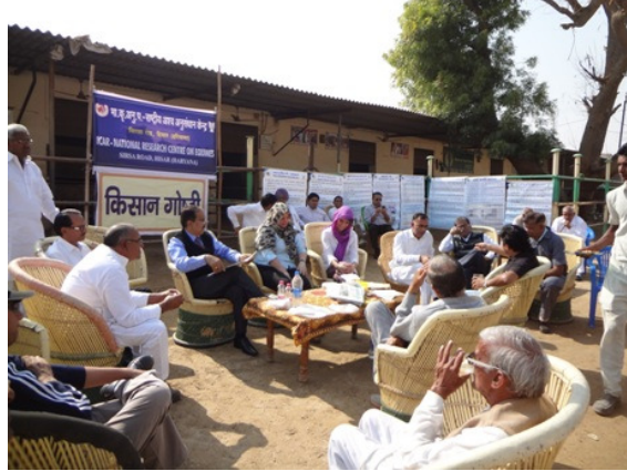
Animal Health Trust team interacting with equine owners at Hanumangarh