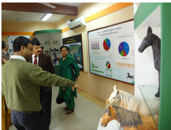
Lt. Gen. N.S. Kanwar, DG RVS at Info-equine Museum, NRCE