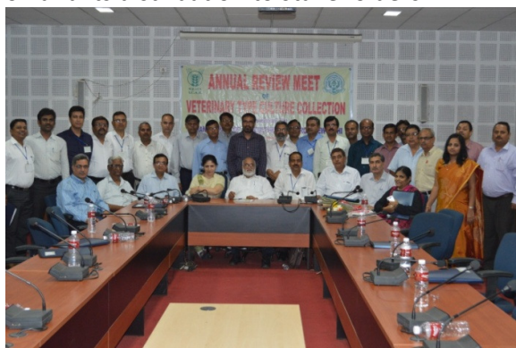
VTCC Annual Review meet at Guwahati