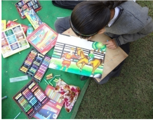
Young mind working on canvas