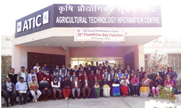
Participants of drawing competition with NRCE staff