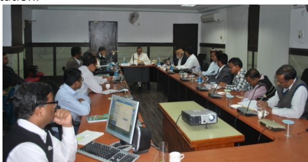
RAC meeting in progress