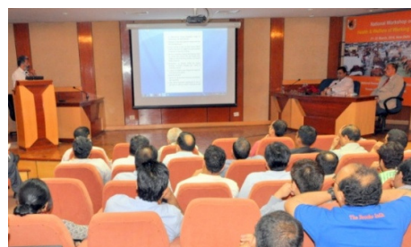
Technical Sessions on Equine Health & Welfare