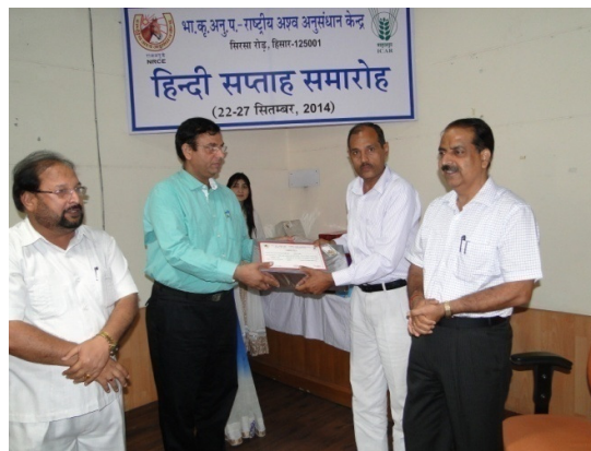
हिन्दी सप्ताह पुरस्कार वितरण समारोह