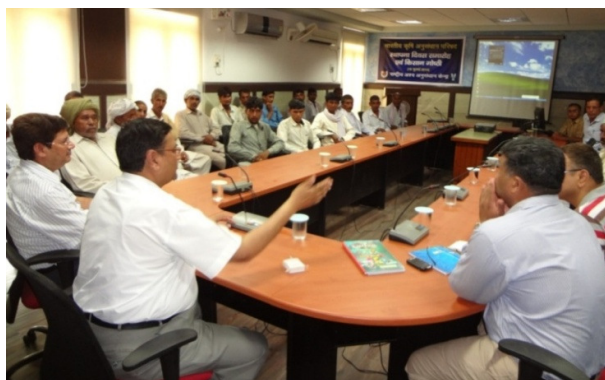
Interactive meet of equine owners on ICAR foundation day

An interactive meet of equine owners and scientists on July 16, 2014 on occasion of ICAR foundation day at ICAR-NRCE, Hisar. The meet was attended by equine owners from Hisar, Rohtak, Bhiwani, Jind, Kurukshetra, Fatehabad and Ambala districts attended the meet. Equine owners and scientists interacted on various aspects of health and management of equines and issues affecting equine welfare during the interactive meet. Questions raised related by equine owners on health and management which were addressed by the scientists. The information about artificial insemination pregnancy diagnosis, diagnostic and consultancy and advisory services provided by NRCE was given to the equine owners. Information on preventive measures in disease control, deworming, hoof care and feeding was given to equine owners by the scientists of the Centre. On this occasion farmers also visited the Info-equine museum at the Centre.