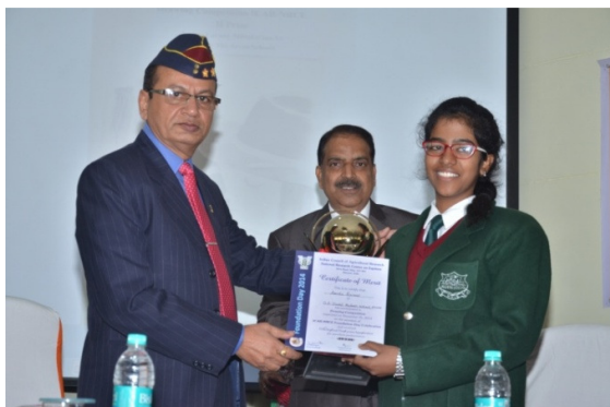
Distribution of prize to winner of drawing competition by Chief Guest