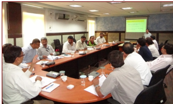
IRC meeting in progress

The Annual Institute Research Committee (IRC) meeting for the year 2013-14 was held under the chairmanship of Director, ICAR-NRCE, Hisar on April 17, 2014 at NRCE, Hisar. The IRC assessed the achievements of the research projects executed during last year in the area of equine health, production, extension, Veterinary Type Culture Collection and externally funded projects. The Chairman, IRC raised concern over the development of equine specific formulation of feed using locally available feed and fodders. Chairman also emphasized on development of more field oriented technologies for utilization and conservation of equines and for combating the emerging and re-emerging diseases.