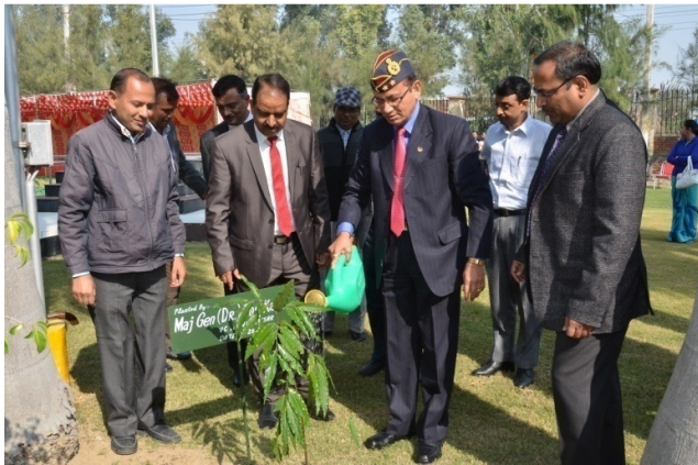
Plantation at NRCE campus by the Chief Guest