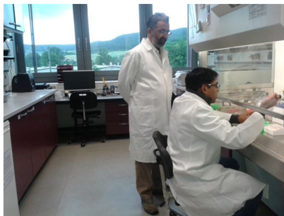
Scientists from candidate lab ICAR-NRCE in parent lab at FLI Germany