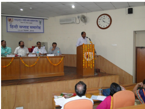
काव्य पाठ प्रतियोगिता का आयोजन